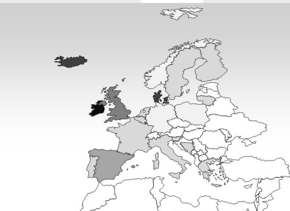
Reflexology Provision by MD and Non-Medical Practitioners per 100'000 Inhabitants (EU 27+12)

no provision: white ○ | no data: off-white ○ | < 1: light gray ○ | < 5: gray ● | < 10: dark gray ● | > 10: black ●