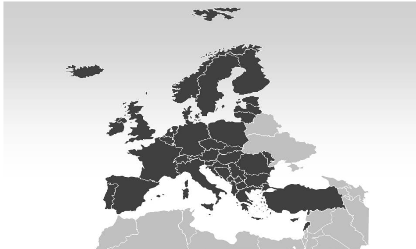
Acupuncture (all countries)

no provision: white ○ | no data: off-white ○ | < 1: light gray ○ | < 5: gray ● | < 10: dark gray ● | > 10: black ●