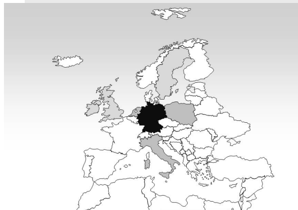
Herbal Medicine Provision by MD and Non-Medical Practitioners per 100'000 Inhabitants (EU 27+12)

no provision: white ○ | no data: off-white ○ | < 1: light gray ○ | < 5: gray ● | < 10: dark gray ● | > 10: black ●