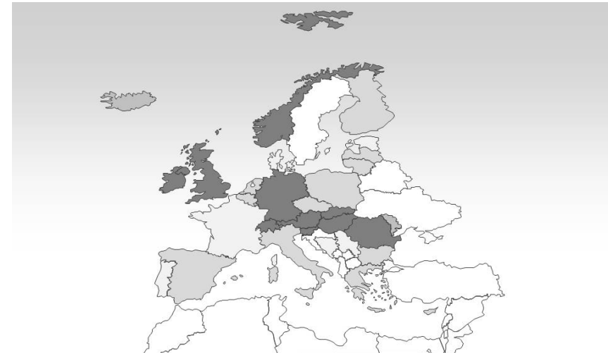
Homeopathy Provision by MD and Non-Medical Practitioners per 100'000 Inhabitants (EU 27+12)

no provision: white ○ | no data: off-white ○ | < 1: light gray ○ | < 5: gray ● | < 10: dark gray ● | > 10: black ●